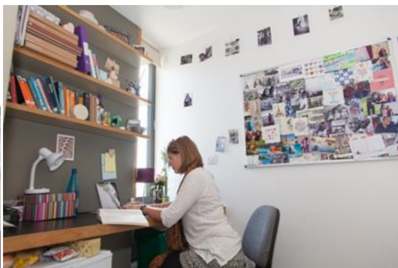
Interiors of a single bedroom in the Ruth Deech Building