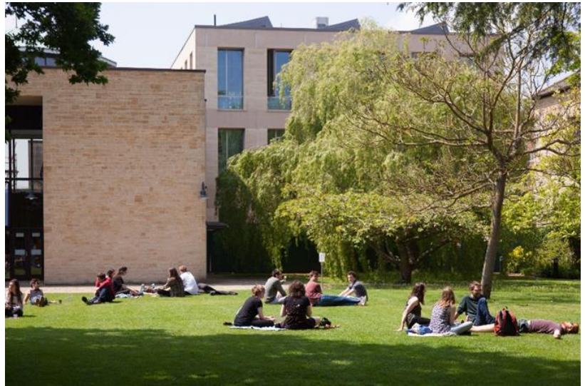
Enjoying the 'Quad', Trinity Term., St Anne's College

We have an excellent reputation for student welfare at St Anne's and we encourage you to be familiar with what's available. The ' welfare team ' includes members of the Decanal Team, College Officers, health and counselling professionals and students – JCR and MCR welfare reps and peer supporters. Be assured that support is here for you. Try to seek guidance and help as early as you can. And of course, confidentiality is maintained at all times.