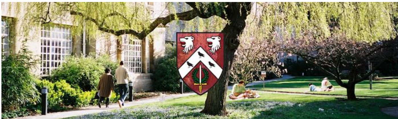
Hartland House, St Anne's College