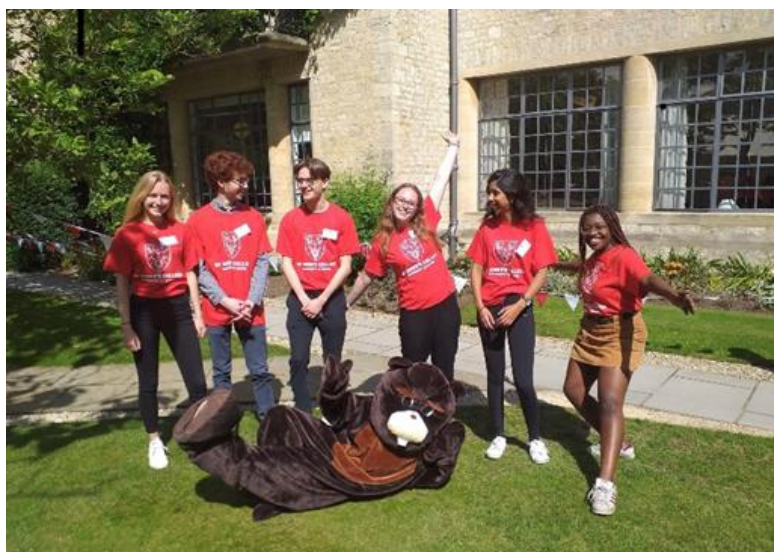
Student helpers with the College beaver on an undergraduate Open Day