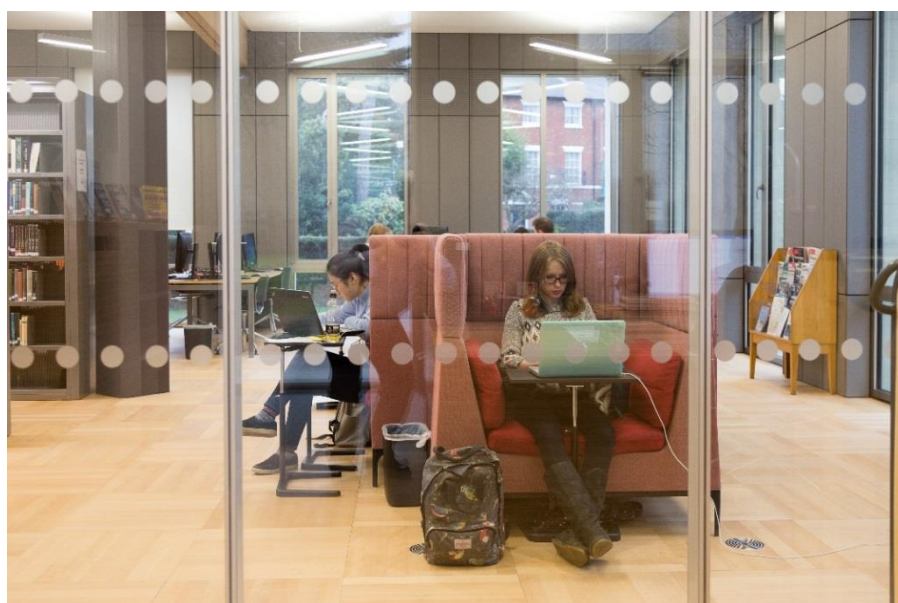
Library and Academic Centre, St Anne's College

Once you arrive in Oxford the College Library staff will host induction sessions for each subject. You can also join a Bodleian Library induction and will also have access to departmental libraries in your subject/s.