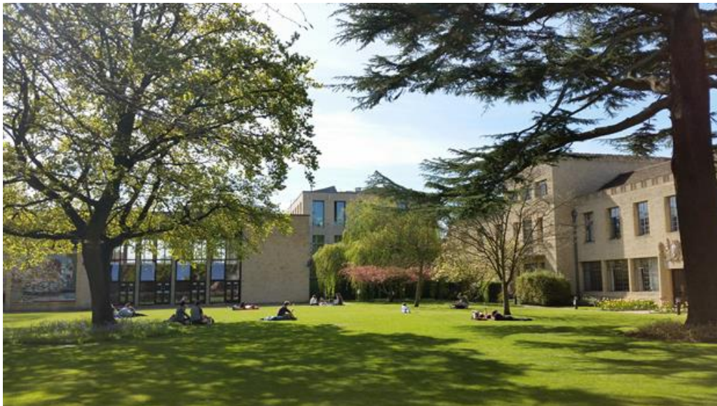
Looking across the Quad to the dining hall and Hartland House, St Anne's College

St Anne's College does not issue interim or provisional transcripts for visiting students and you are advised to request a transcript that includes your study abroad programme from your home institution. If you have exceptional circumstances, for example a scholarship application, please speak with the Academic Office.