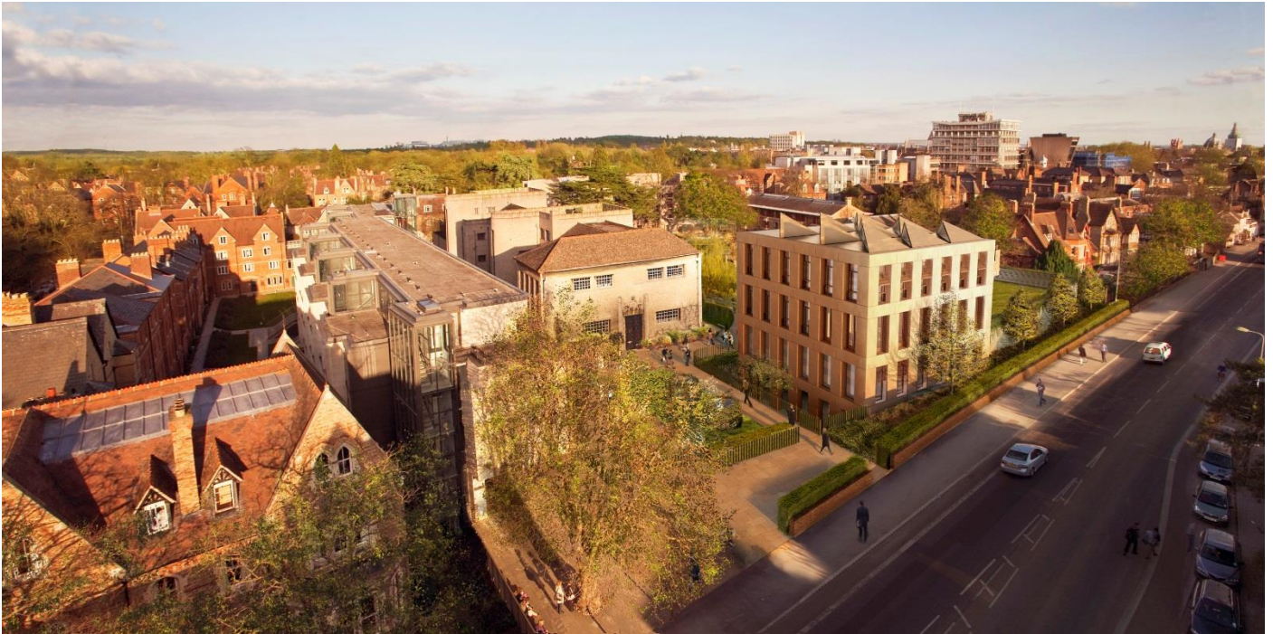
Aerial view of St Anne's College