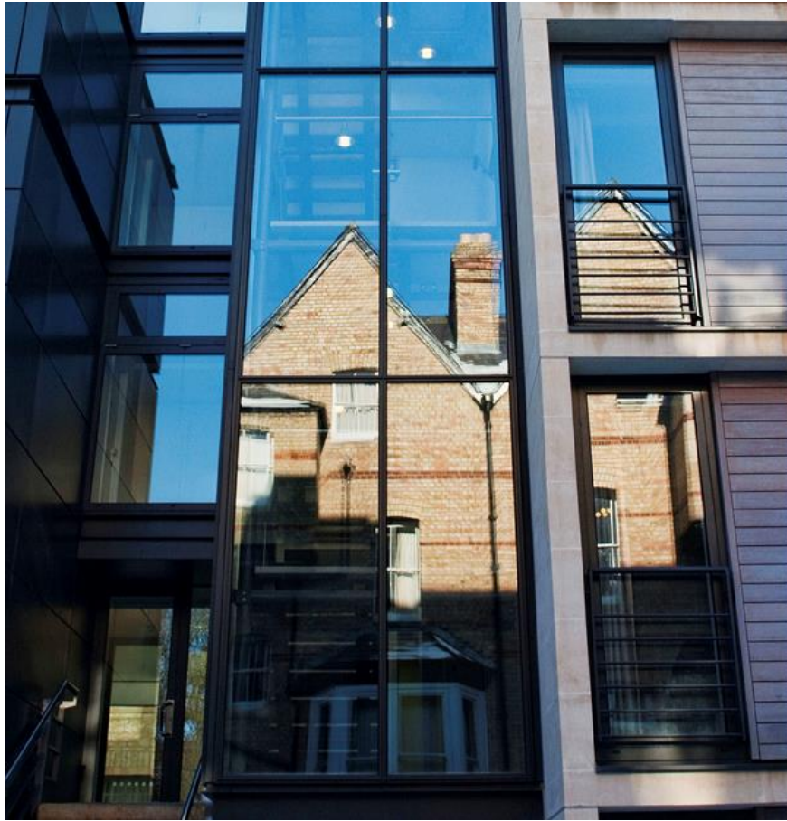
Bevington Road Houses reflected in Ruth Deech Building, St Anne's College