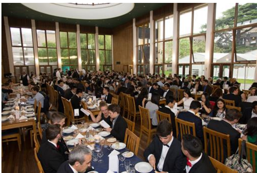
Students at a 'Formal' dinner in the Dining Hall

As a Visiting Student your University card will be pre-loaded with a meal credit for you to utilise upon arrival. You will need to top this up throughout the term and emails will be sent to you, and the dining hall staff will remind you, when your credit is running low. You can then top-up at any time via the on-line payments system. A bar fund can also be set up to run alongside your account, which will enable you to use your University card to pay in the Bar.