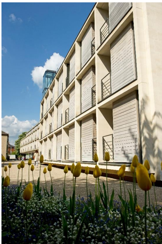
Exterior of the Ruth Deech Building

St Anne's is one of the largest and most diverse Colleges in Oxford and our Visiting Students make a major contribution to our collegiate life.