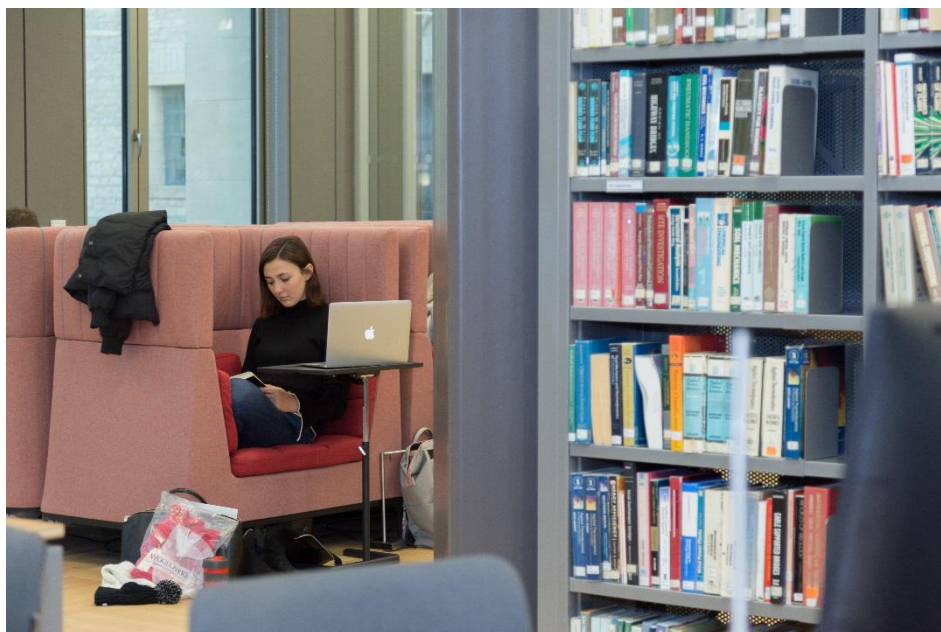
Library and Academic Centre, St Anne's College