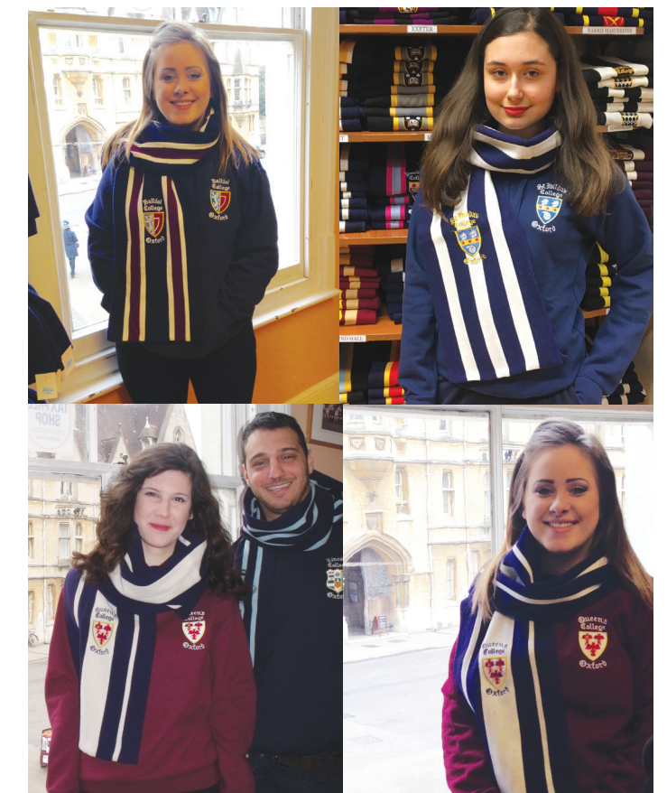
College Scarves + Hoodies